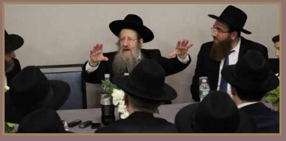
Rav Yitzchok Sorotzkin