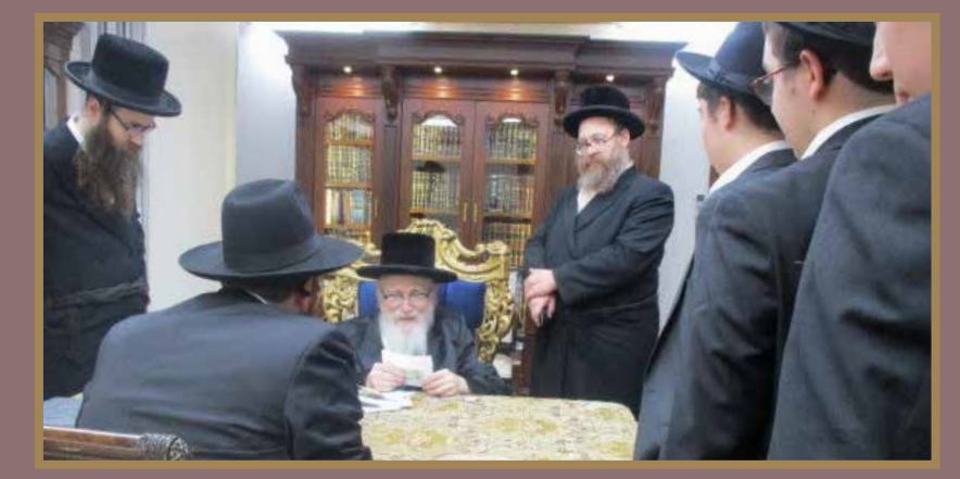
The Skverer Rebbe