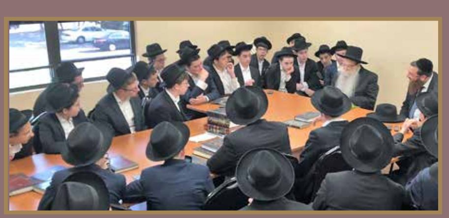
Rav Yerucham Olshin