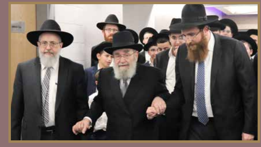
Rav Reuven Feinstein